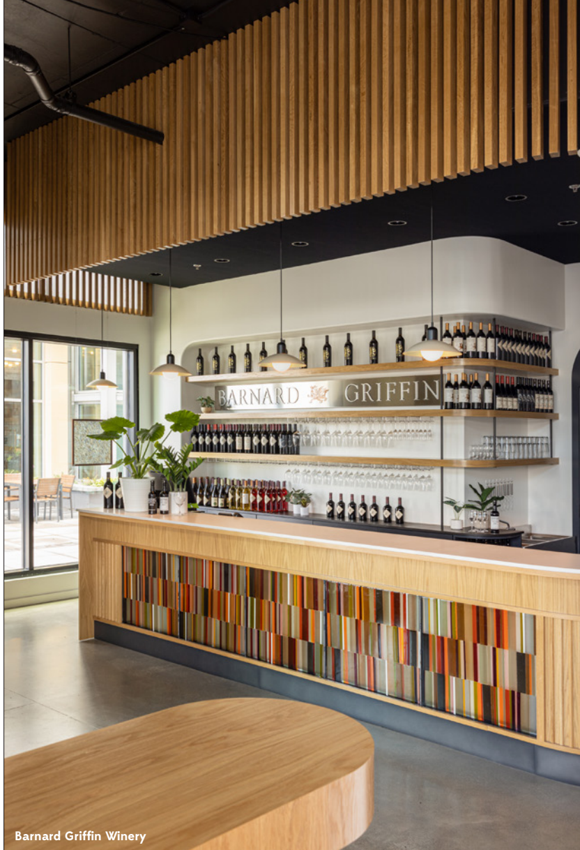
Barnard Griffin Winery