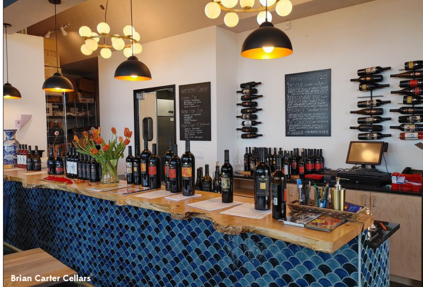
Brian Carter Cellars