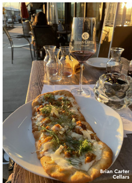
Brian Carter Cellars

Before you call it a night, head to Ice CREAM RENAISSANCE for a treat. Grab a scoop of honey vanilla ice cream or choose a vegan option such as minted cookie crunch. All of the ice cream is made in small batches. Enjoy your scoop while walking the neighborhood or snag a seat by the fireplace and play a board game to end a fun-filled day of experiencing the sites, smells and flavors of Vancouver. ●